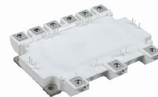
GVC Series 750V / 400A