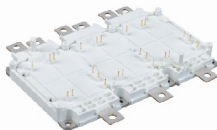
GV / NV Series IGBT: 750V, 1200V / 600A, 820A, 950A SiC: 1200V/540A, 439A