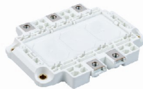
GVD Series 750V / 280A, 400A