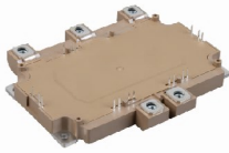
GVB Series 750V / 400A